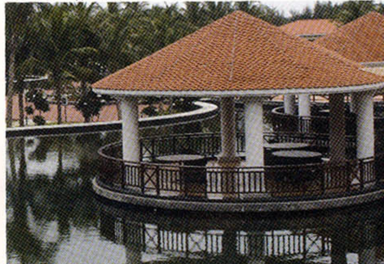
ocrans spray resort. | pudurheny